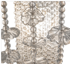
clear crystals & blown glass daisies