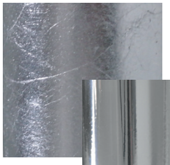
silver leaf / silver plated details